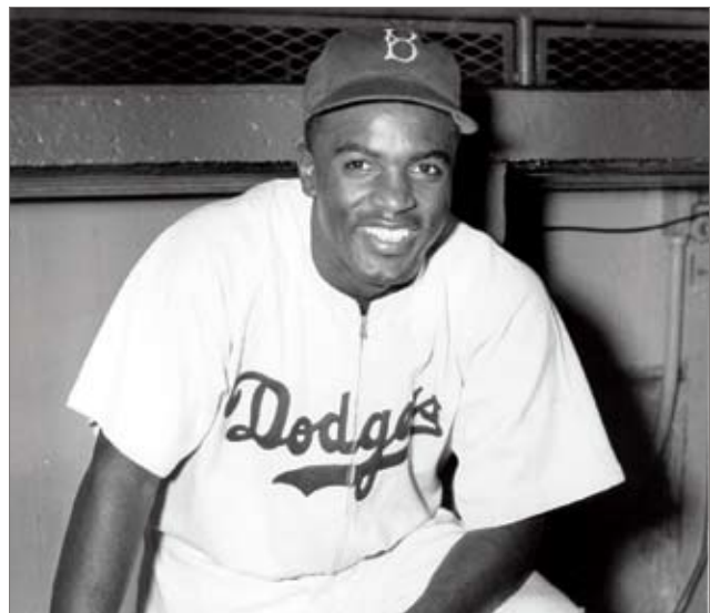
Jackie Robinson, Hall of Fame baseball player.