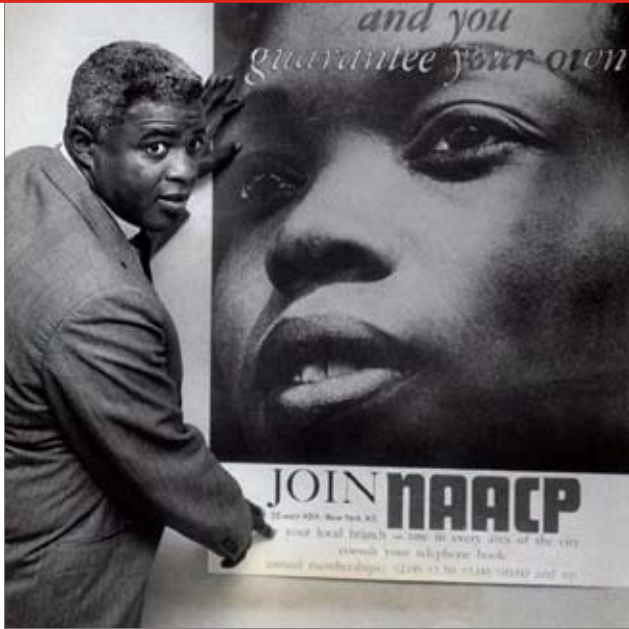
Jackie Robinson was an ardent supporter of the Civil Rights movement and the NAACP