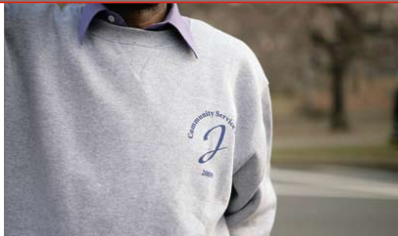
Academic Excellence and Community Service are at the heart of what it means to be a JRF Scholar. Scholars are required to participate in community service as part of their scholarship.

JRF Scholars are expected to conduct themselves as mature and responsible members of both the JRF Family and of their university communities even though this standard of conduct reflects higher expectations than may be prevalent outside the JRF Family. JRF Scholars should take pride in the legacy of Rachel and Jackie Robinson and in the reputation of the Foundation; they appreciate the leadership development programs offered; and they acknowledge benefitting from the wealth of experience found among the Foundation's alumni and many associations. At the core of the Rachel and Jackie Robinson legacy are Achievement, Leadership, and Service . These three values are at the heart of what it means to be a JRF Scholar.