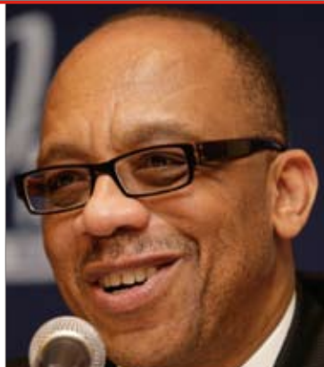
ABOVE Pulitzer Prize-winning, syndicated columnist Eugene Robinson